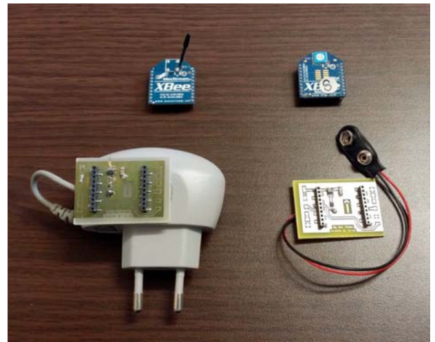
Fig. 1. ZigBee modules (XBee series 1 from Digi) wire antenna (top left) and chip antenna (top right) and PCB with power supply: wall plug revamped from a mobile phone (bottom left) and battery powered (bottom right)

either, exploiting the radio connectivity information among neighboring nodes, or exploiting the sensing capabilities that each sensor node possesses. Due to the distinct characteristics of these two approaches, we categorize the range-free localization schemes into: anchor-based schemes (which assume the presence of sensor nodes in the network that have knowledge about their location) and anchor-free schemes, which require no special sensor nodes for localization. Our proposal belongs to the category of range-free solution (anchor-based). In this context, several technologies are naturally candidates: WiFi, Bluetooth (BT), ZigBee (ZB). WiFi present best performances in terms of throughput and range. This is however not the criteria that interest us. Indeed, a low cost and a reduced range were privileged. The WiFi was thus not retained. The short range of other solutions mentioned above (BT, ZB) allows us to consider reduced radiation areas for each anchor, and be consistent with the scale of the areas identified through our system. To choose between these two technologies, we considered the energy consumption criterion, since all of the objects should be battery powered. We therefore choose the ZB solution.